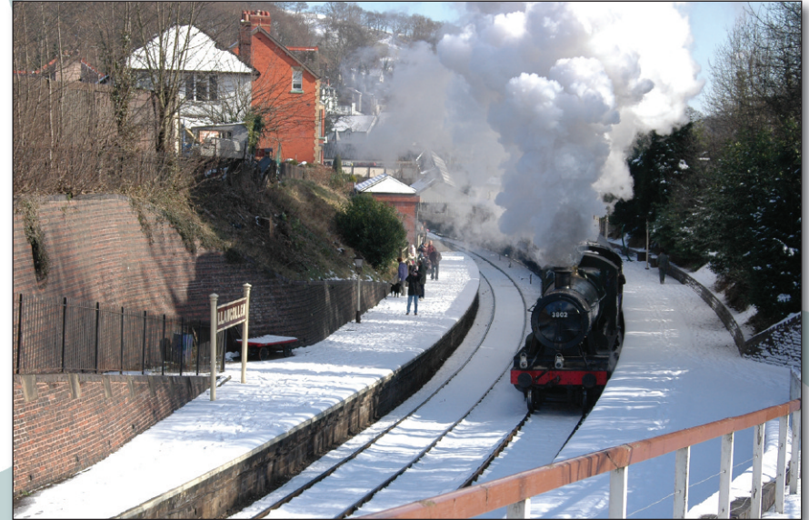
Sun, snow and freezing conditions offer a more dramatic scene with GWR 38xx No. 3802 producing a crisp white exhaust.