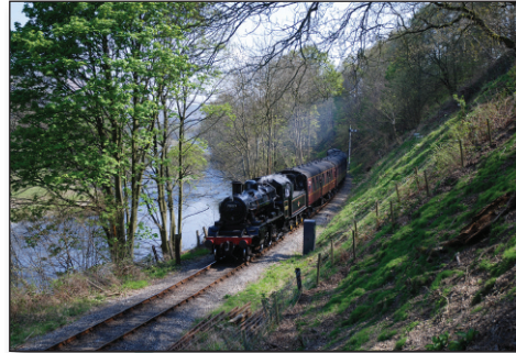
Beneath Owain Glyndwr's Mount the railway is squeezed between the river and former castle motte. During the 2007 Grange Gala No. 78019, visiting from the Great Central Railway, re-enacts a 1950s' scene.