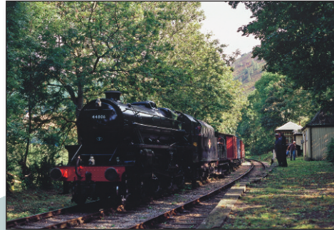
The trees that surround Deeside Halt create a dappled light over the railway's Black 5 No. 44806.