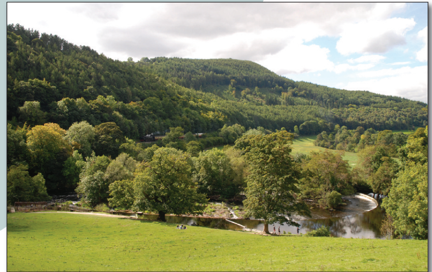
The Horseshoe Falls, which feed the Llangollen Canal from the River Dee, sweep across the foreground with the railway clinging to the hillside above.