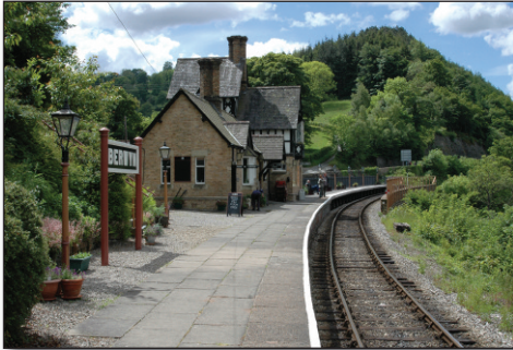
Berwyn Station encapsulates the traditional quiet Great Western Railway country station . . .