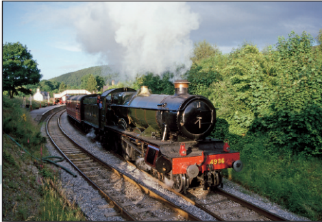
In 2001 the Midsummer land cruise was in the hands of visiting ex-Great Western Railway Hall class No. 4936 'Kinlet Hall' which made a typically spirited departure from Glyndyfrdwy.